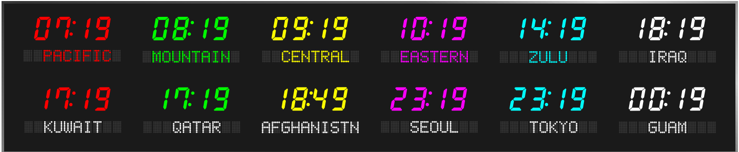
Model 6612AJ - 2.5" time, 1.2" zone labels, 12 zones